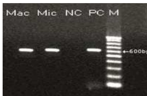
Fig 4. PCR-product of microscopic and macroscopic cyst. M: Molecular weight marker (100bp), Mic: Microcyst, Mac: Macrocyst, NC: Negative Control, PC: Positive Control.