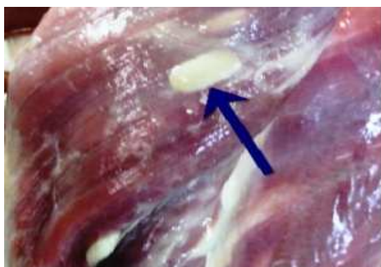
Fig 1. Macroscopic cyst in muscle of sheep.